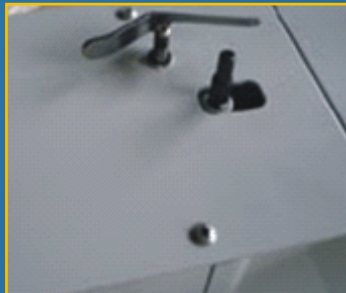
Automatic Bobbin winder (included)