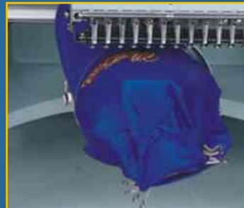
270 degree cap system (included)