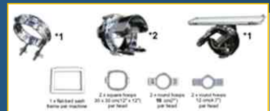
Includes 270 caps system, 1 cap gauge and 2 cap frames