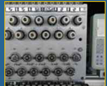
Automatic rotary thread break detection system (included)