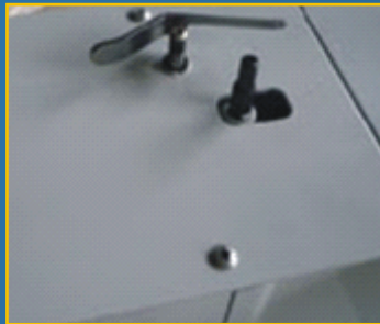
Automatic Bobbin winder (included)