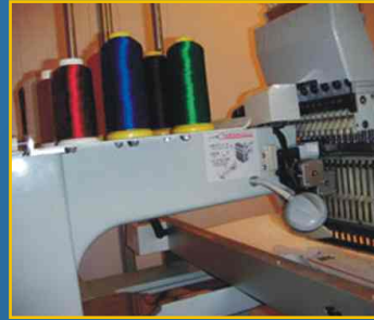
High quality steel arm construction (standard)