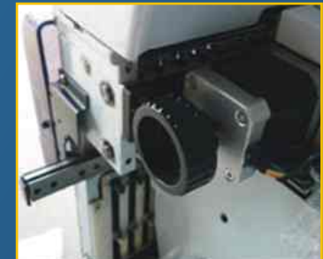
Automatic Color Change system (included)