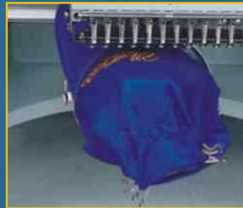
270 degree cap system (included)