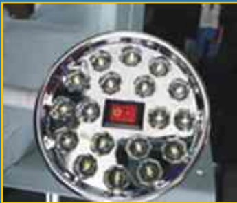
LED Lighting (included)