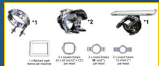
Includes 270 caps system, 1 cap gauge and 2 cap frames