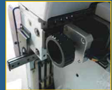
Automatic Color Change system (included)