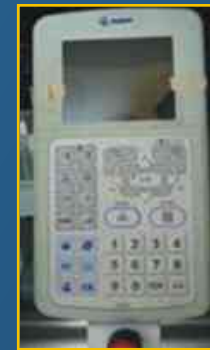
4x4 Color display control panel (standard)