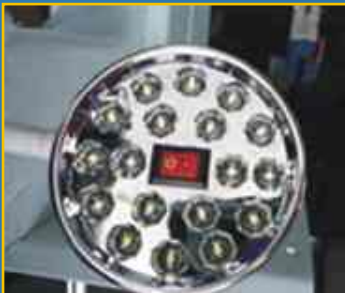
LED Lighting (included)