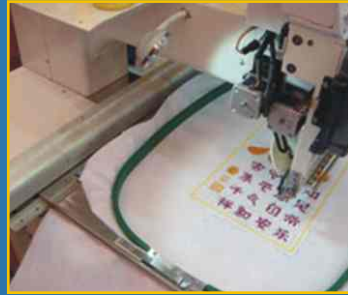
Large sewing area (standard)